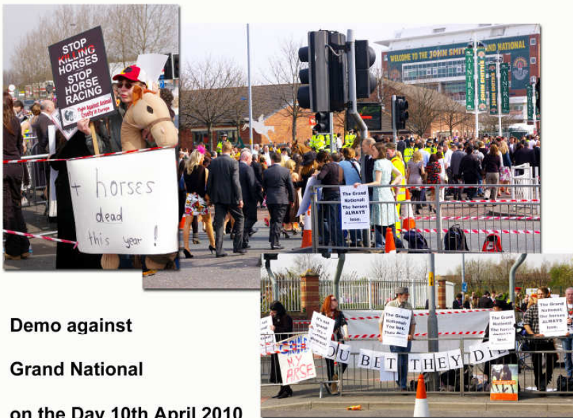
Demo against Grand National on the Day 10th April 2010

Once again FAACE and Animal Aid held a demonstration against the "Grand National".