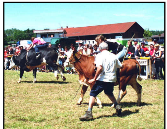
Beating ox to make it run

As part of an ongoing campaign we have been tracking and monitoring Ox racing in Bavaria, Germany. It involves transporting bullocks around the country, which causes a great deal of stress, as does the riding, racing and beating of them. We have made a number of complaints.