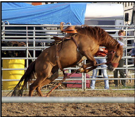
Dangerous loose head rope

Although, the flank strap has been banned, due to the work of FAACE in cooperation with INITIATIVE ANTI-CORRIDA , Germany, there are still ongoing problems, such as the loose head rope that is dangerous for the horses.