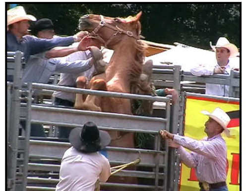
Horse rearing in chute

We also work with groups in France, as the rodeos travel from Germany to France where the cruelty is even more out of control due to lack of supervision.